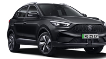
BLACK PEARL METALLIC PAINT*