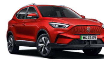
DYNAMIC RED TRI-COAT PAINT*

*Tri-coat and metallic paint optional at extra cost.