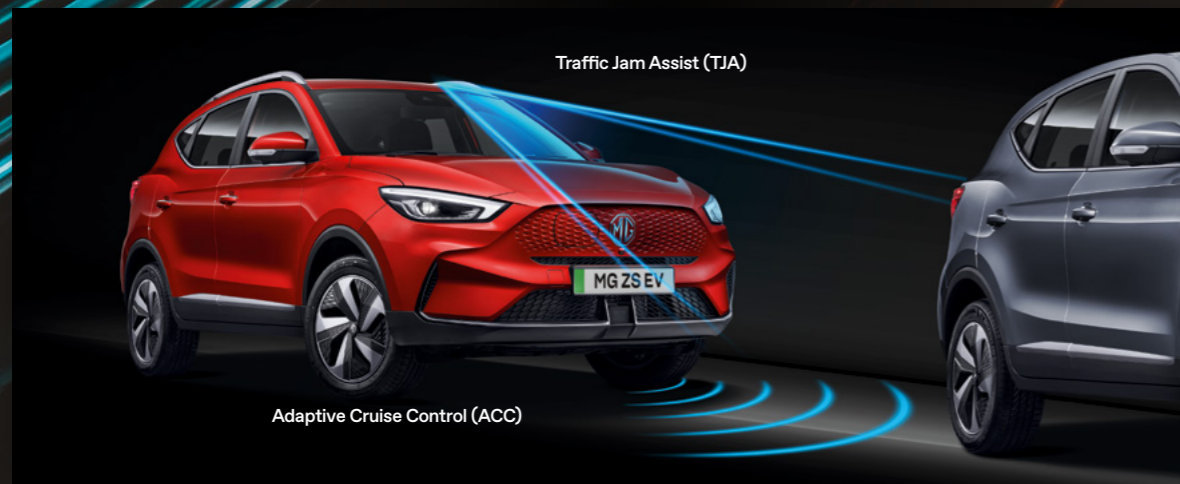
Traffic Jam Assist (TJA)

The MG Pilot suite of high-tech driver assistance technology gives you added confidence on the road. A selection of warning and alert features assist the driver, maintaining safety and simplifying everyday driving.