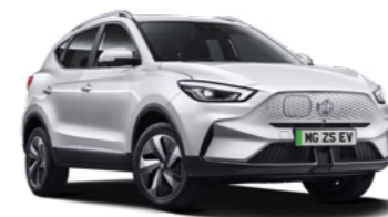
ARCTIC WHITE STANDARD PAINT