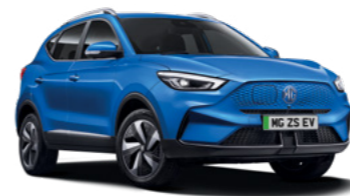
BATTERSEA BLUE METALLIC PAINT*