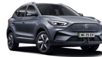
MONUMENT SILVER METALLIC PAINT*